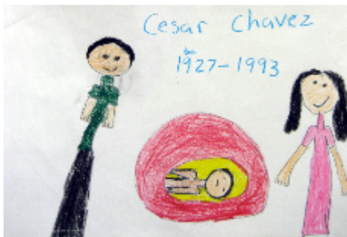
sample panels #1 and #4