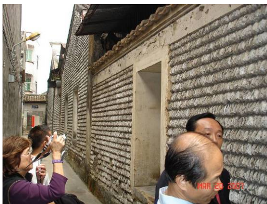
The vast oyster shell wall (right side) proves Oo Syak was once surrounded by water.