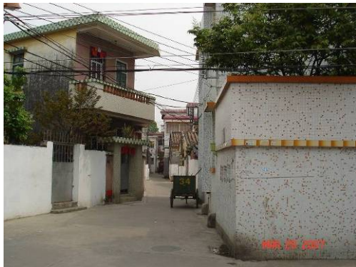
The residential part of Oo Syak Village with narrow walking lanes.