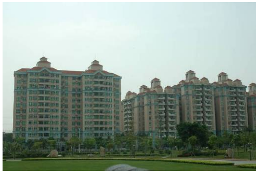
Some newly developed high-rise apartment buildings with surrounding beautiful landscapes.