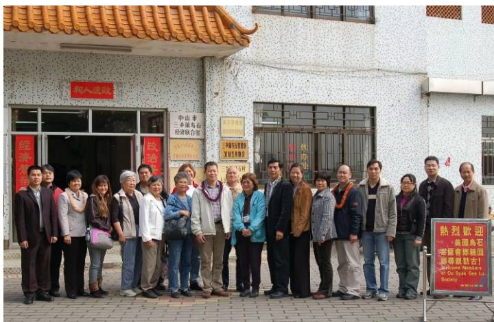
The Hawaii Oo Syak group outside the Oo Syak government headquarter building with Oo Syak officials and a “welcome home” sign.