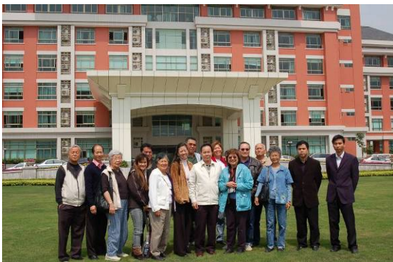
Left: The Hawaii Oo Syak group with Zhongshan officials outside the back of the newly built government building.