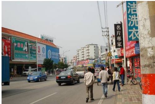
The busy street life in Sam Heong – modern looking, with taller buildings, paved roads, and automobiles.