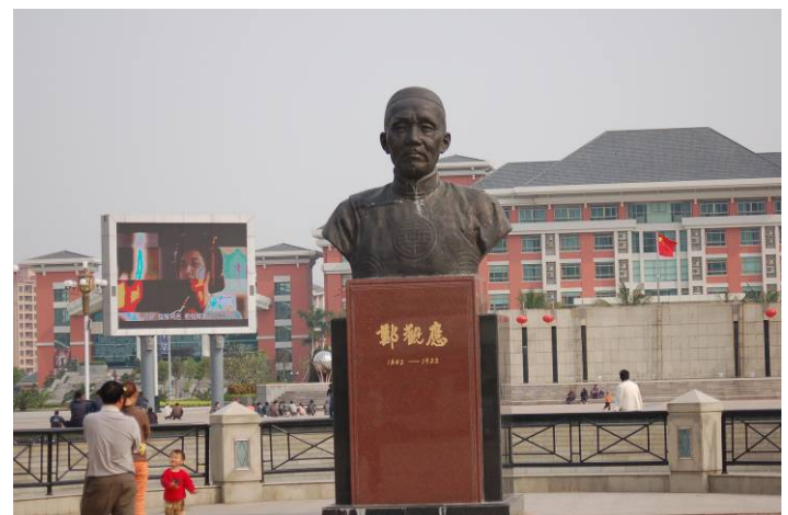
Cheng Kwun Ying Statue in the park where they play free movies all day/night on the big screen monitor. The Zhongshan government building is in the back.