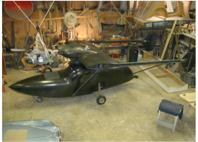
A teaser for the June meeting