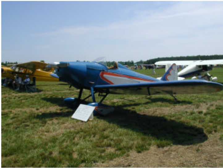
Fly Baby at Horn Pt, built ~1976