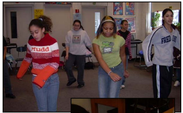
As part of the 21st Century Project, children are offered the opportunity to make scrap books and take dance classes, as well as other activities.

The activities offered through the 21 st Century program are developed to enrich the lives of the children and educate them outside the classroom. The skills that they learn might inspire them or influence them later in life. As the program's slogan attests, "After school is cool!" Δ