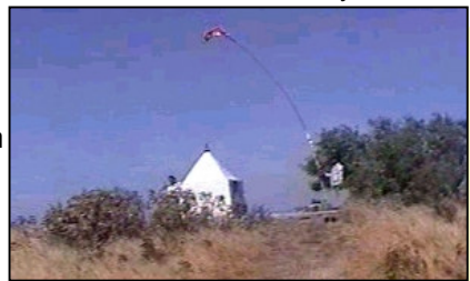
Temple at Duke's Nose summit

Khandala Railway Station (18.75501N, 73.37611E) 1837 feet (560 meters)