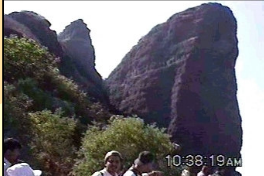
View of Duke's Nose summit from point 'B'

Motorable road ——— Hike Trail ..... Height in feet above mean sea level indicated, (19.38685N,73.77917E) indicates latitude and longitude in degrees in decimal format