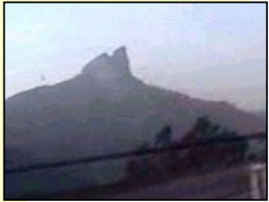
Summit view from point 'A'