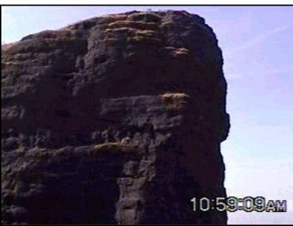
Summit view from point 'C'

Car Parking (18.75811N, 73.37655E) 1821 feet (555 meters)