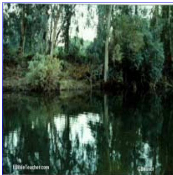
Jordan River, where John baptised

Jesus taught that the Law and Prophets were proclaimed until the time of John the Baptist, since which time the Kingdom of Heaven was being preached .