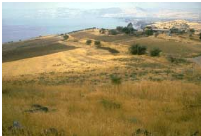
Mount of Beatitudes, towards the Sea of Galilee

“Those who begin with the idea of the Kingdom as a people base their definition upon the identity of the Kingdom with the Church, and for this there is very little scriptural warrant.” 15