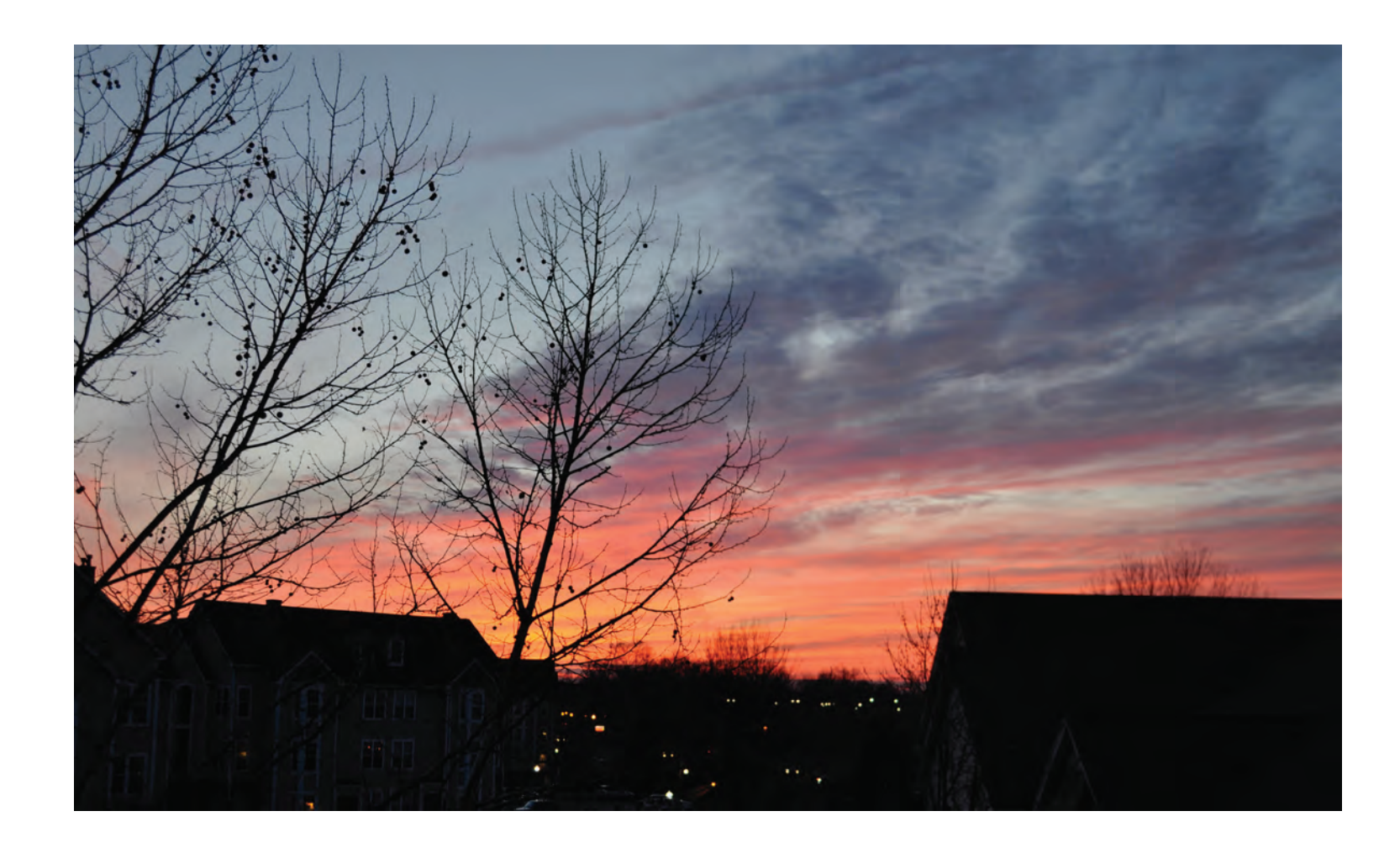
Image taken for landscape photography assignment, used Nikon camera and photoshop to edit