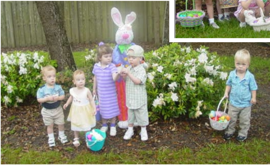
Left: The toddlers had fun, too!