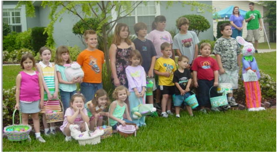
Right: The older kids gathered to say "cheese" with the bunny.