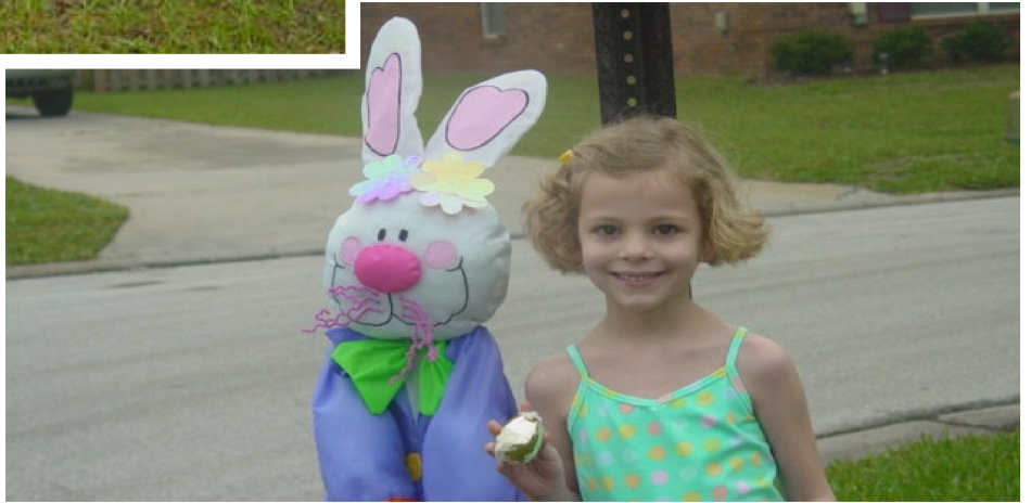
Left: This is what it is all about!