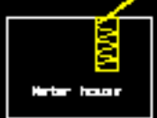
GROUND FLOOR PLAN 1:200