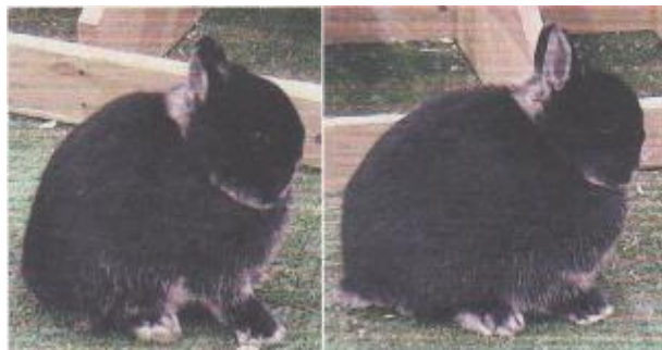
Love's Ultra Mag CMDRC OPEN BOB