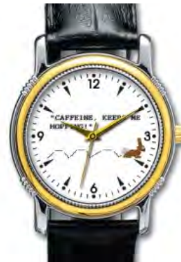
“Caffeine Keeps Me Hopping” —$20