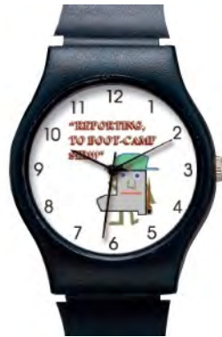
“Reporting to Boot Camp, Sir.” —$15

Currently, four of Miss Huttner’s cartoons are portrayed on watches. The four watches below are available for mail-in purchase. For a complete listing of all watches, please email or call the numbers listed on the front.