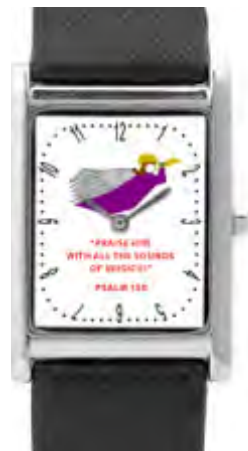
PSALM 150 —$20

The Jesus and the Angel design, portrayed above, are also available for purchase in a round face.