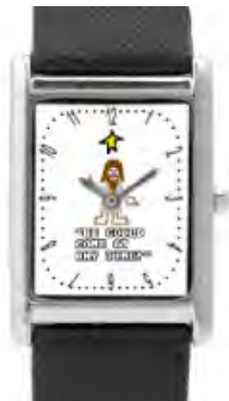
“He Could Come at Any Time.” —$20