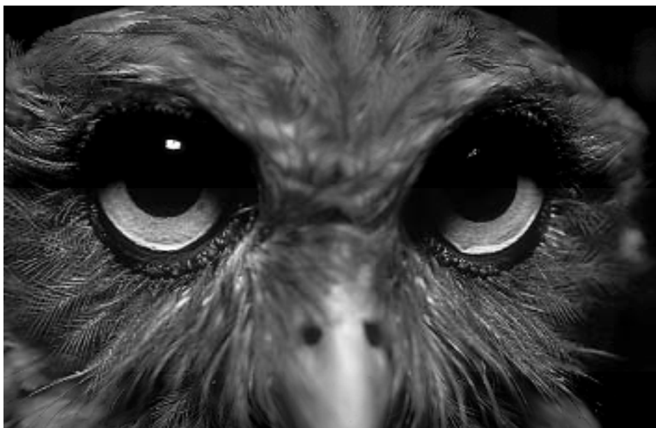
1st Place BENNY BONDOC