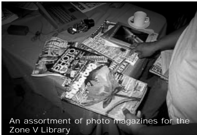
An assortment of photo magazines for the Zone V Library