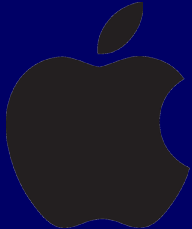
Table of Contents— Computer Programming