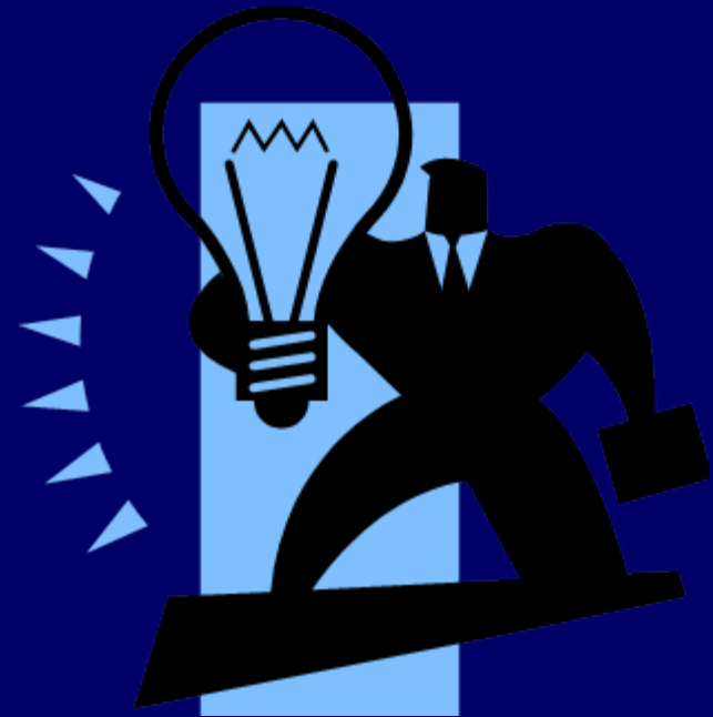
Table of Contents— Computer Programming