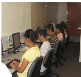
Below: E=MC2 Right?