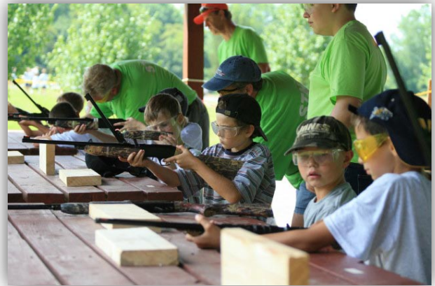
Day Camp – Boys Shooting BB