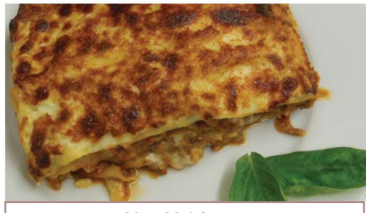
Mama Mia's Lasagne