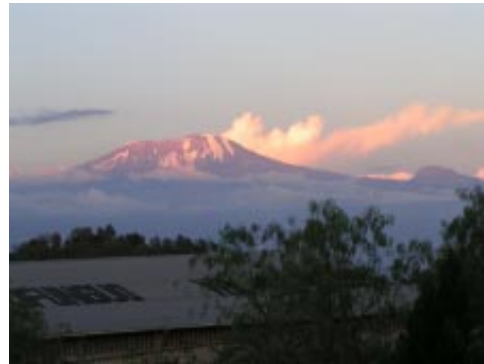
A view of Mount Kilimanjaro from the front yard of the house where we stayed.

Since February of 1998, one month before our wedding, we have been looking forward to following the Lord's call for us to become missionaries to Tanzania, East Africa. We didn't know what our future would hold after Dave ended