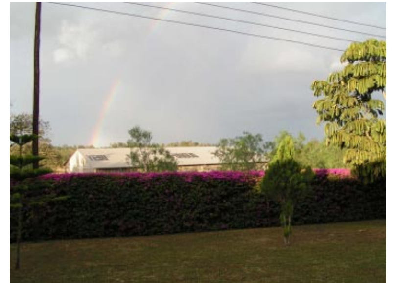
The view from our porch after a rain shower. Notice the rainbow directly over the word Yesu (Jesus) on the seminar/church building.

Although the work we did was very rewarding, we learned the most from individual interaction with the people. We witnessed intense hunger for God and diligence in studies among the 122 Bible school students, many of whom not only attended prayer at 4:00 a.m. and classes all day long but could also be seen studying and reading their Bibles late into the night. We enjoyed the welcoming attention and interest shown by children everywhere we went. They were easy to fall in love with and quick to return affection. And we will never forget the friends of all ages we made and were able to converse with through a combination of rudimentary Swahili on our part and basic English on their part (or sometimes very good English on their part and little or no Swahili on our part). If all else failed, we found translators or simply communicated without understanding all of the words. Truly