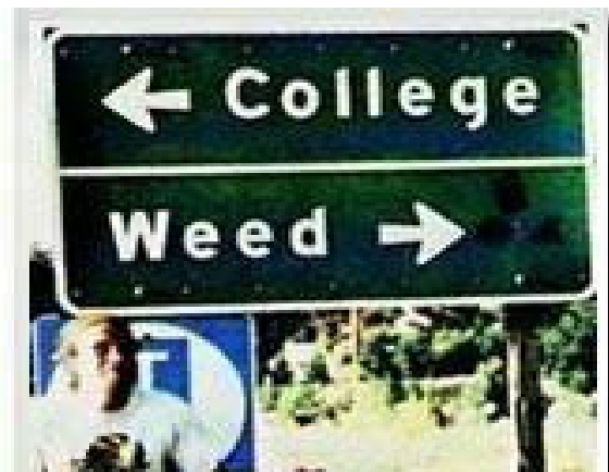
True California Road Signs