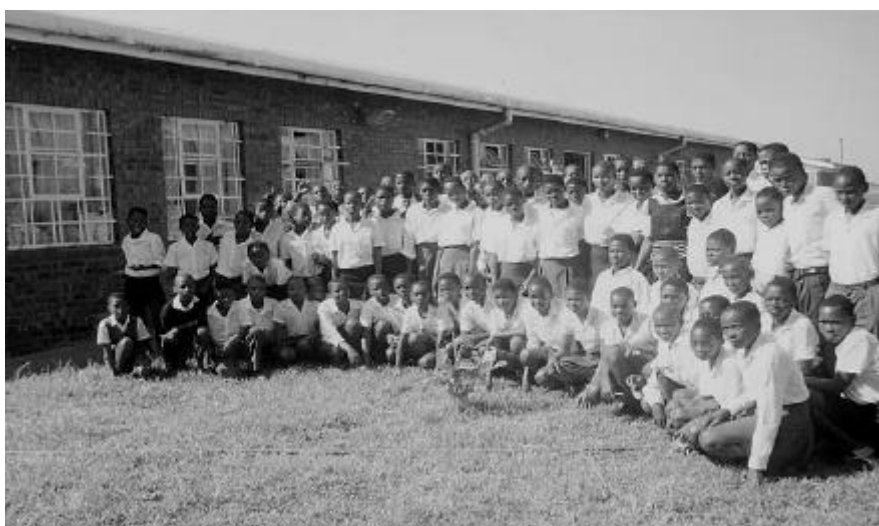
Learners from the Jozini site outside their classrooms

The big question from the boys from both grades was why the project is about " prevention of violence against girls "? They felt that this did not respond to the fact that they too were subject to violence. This was echoed by the boys from the other grades as well as some of the girls in grade 7.