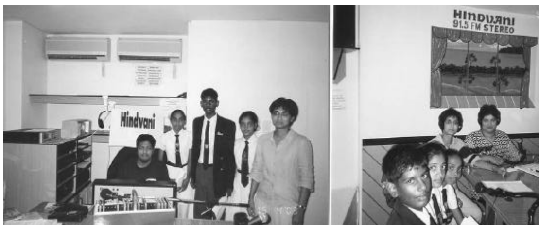
Chatsworth Learners and Facilitator on air at Hindvani Community Radio Station

Three learners from the core group visited a community radio station, Hindvani, together with the facilitator, to share their views on the issue of gender based violence on the 15th April 2003. Their call-in programme resulted in much interaction with the listener community.