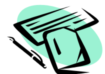
Vendor payments are created from your accounting system.