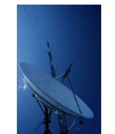
Information is obtained electronically from the selected vendor.

The reporting capabilities of the InvoiceCheck® program allows for customized reports as well as over 70 built-in reports. Operations personnel can have read-only access to obtain important statistical and quantitative information. Reports are also Web-accessible.