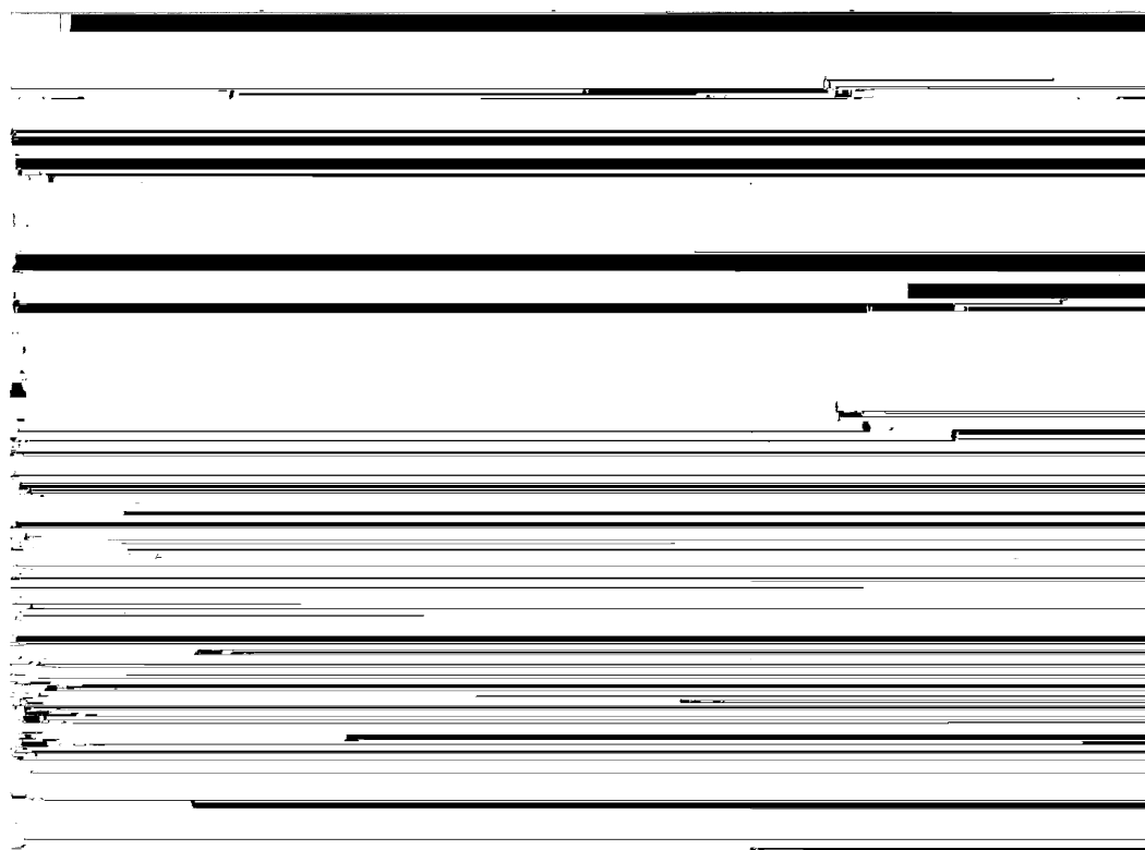
Figure 1. Location of the study area showing primary (submergence) and secondary (contiguous forest) zones of impact.

located at every 250 m interval along its diagonal. In this way, a total of 288 plots, (i.e. 28.8 ha) from the SZ and 265 plots, (i.e. 26.5 ha) from the CZ were sampled. In each sample plot, the all-woody plants with more than 50 cm height were counted. The species–area curve indicates a steady increase in the number of species that starts flattening after 16 and 24 ha of sampling in the two study zones (Figure 2). This suggests that sampling has been done adequately to record the woody species richness of the area.