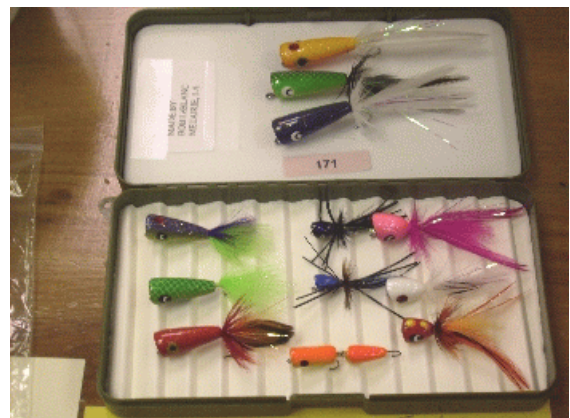
A Nice Set of Poppers in the Raffle