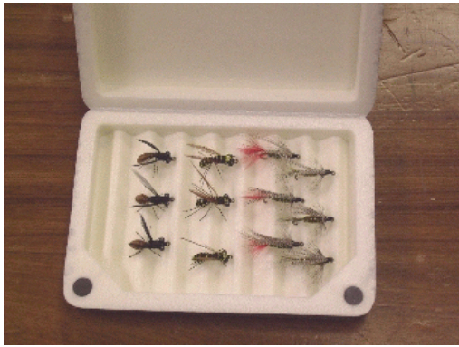
Set of Flies in the Raffle - some of these look ready to fly away!