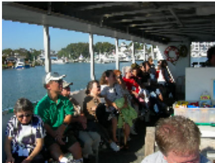
Enjoying the Saturday pontoon boat ride.