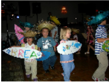
Surf Board Parade

This kids displayed their surf board projects Saturday night.