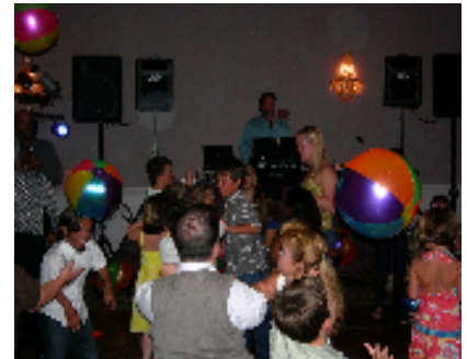
Tearin' it up on the dance floor