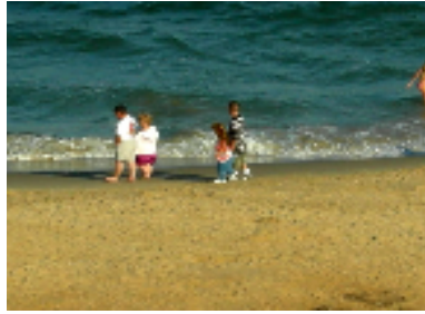
Regional Conference attendees enjoy the Virginia Beach Oceanfront.

This kids displayed their surf board projects Saturday night.