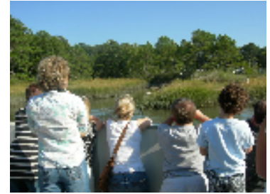
Virginia Aquarium Tour