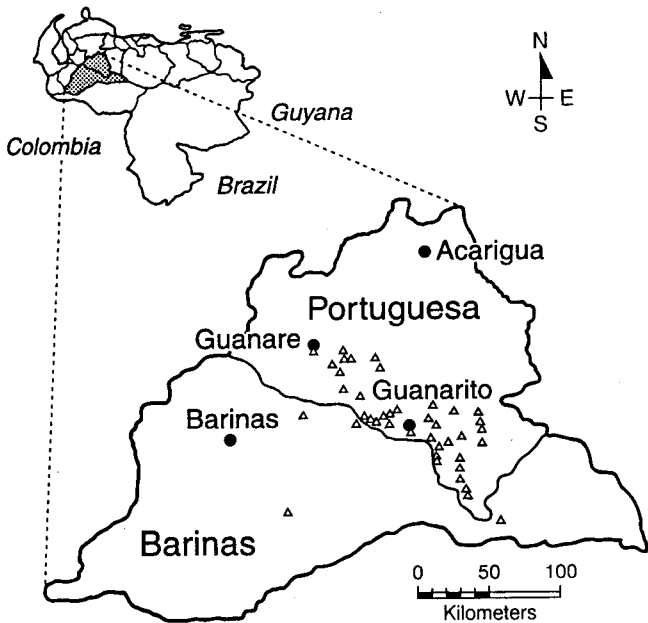
Figure 1. Upper left, map of Venezuela showing the locations (shaded) of the states of Portuguesa and Barinas. Lower right, enlarged map of the same two states, showing the approximate locality of residence ( \Delta ) of all patients with Venezuelan hemorrhagic fever (VHF; n = 42 ) who were reported in 1996.

document contained clinical and demographic data as well as results of selected laboratory tests.