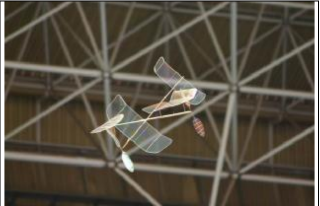
Collision on the air