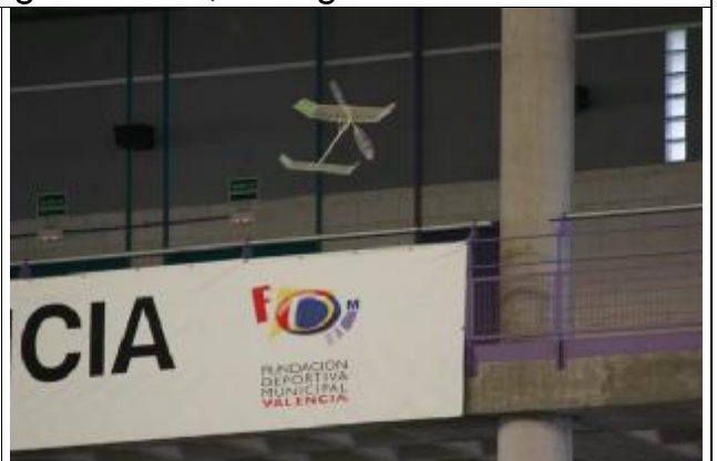
model flying all the available high