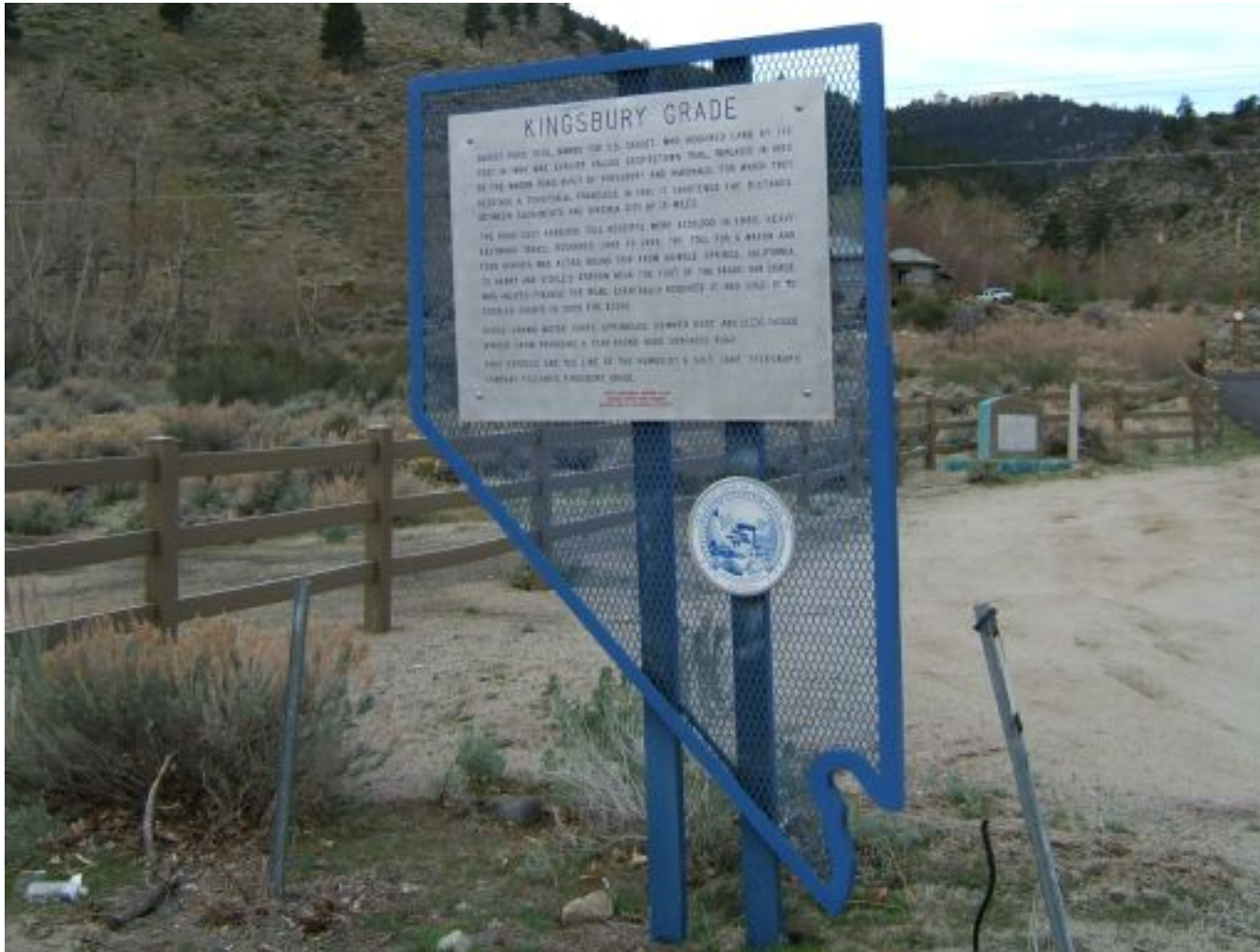
Kingsbury Grade April 7th, 2007