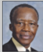
King B.L. Jeffcoat