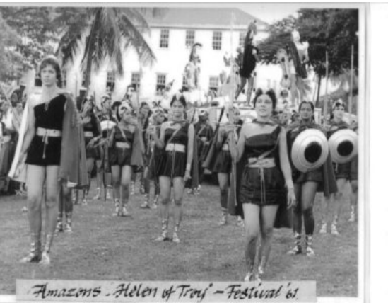
Guyana's Beauties portraying Amazons in Helen of Troy, Festival 1961. Recognise anyone?