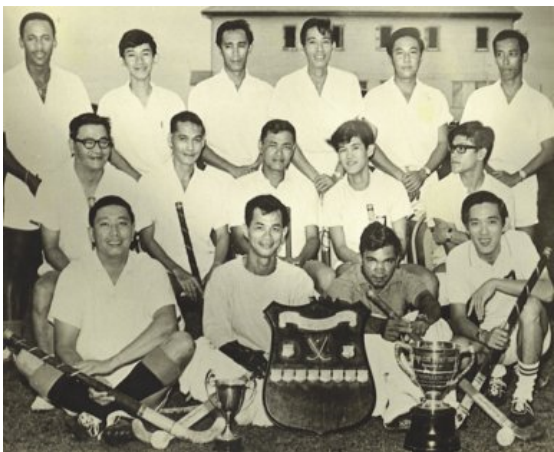
Cosmos Hockey Champions of the early sixties. Many are annual attendees at LLL.