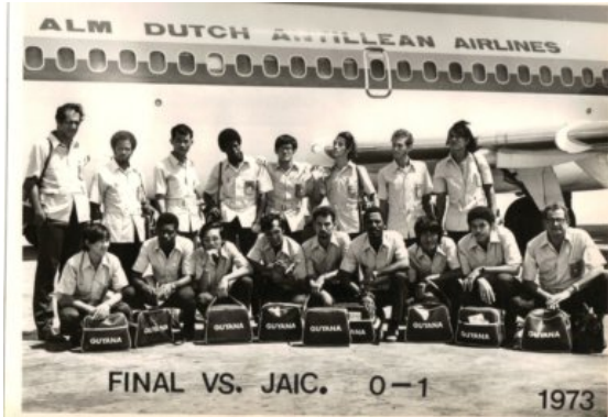
Finalists Caribbean Hockey Festival 1973 - Lost 0-1 to Jamaica.