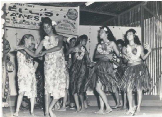
Bookers Universal Staff portraying 'South Pacific' from my Rodgers & Hammerstein Albums - Shell's Guyana Spectacular - Costumed Band of the Year Festival 1962.