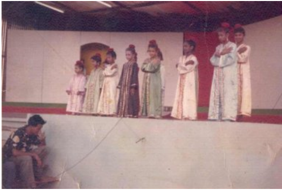
The Siamese Children from 'King & I' - Winners in the Children's Festival 1962 - Band of the Year - Godfrey's Shell's Guyanese Spectacular. Now adults - I have invited all to LLL. Child Care Service will be provided