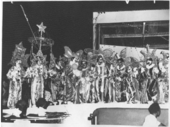
Individual of the Year - 1962 Festival - Band of the Year - Shell's Guyanese Spectacular leads the Fancy Clowns Section on stage.