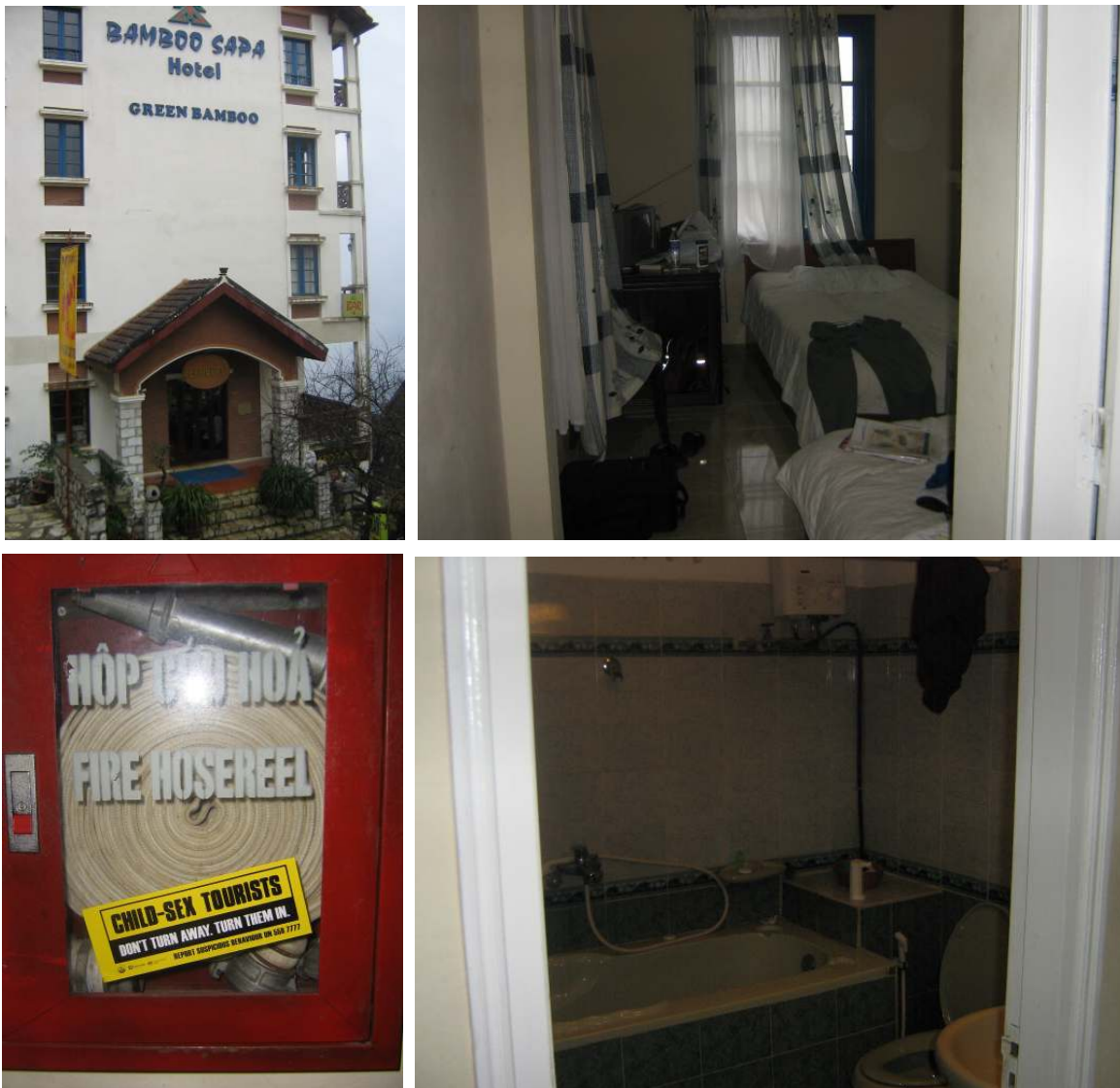
Figure 9: Our hotel (top left) and our room (top right) with its two beds. At bottom left are a fire-hose and a warning against child-sex tourism. The fire-hose indicates the hotel is quite new, and the sign indicates an awareness of a problem common to Asia. Below right is our bathroom.