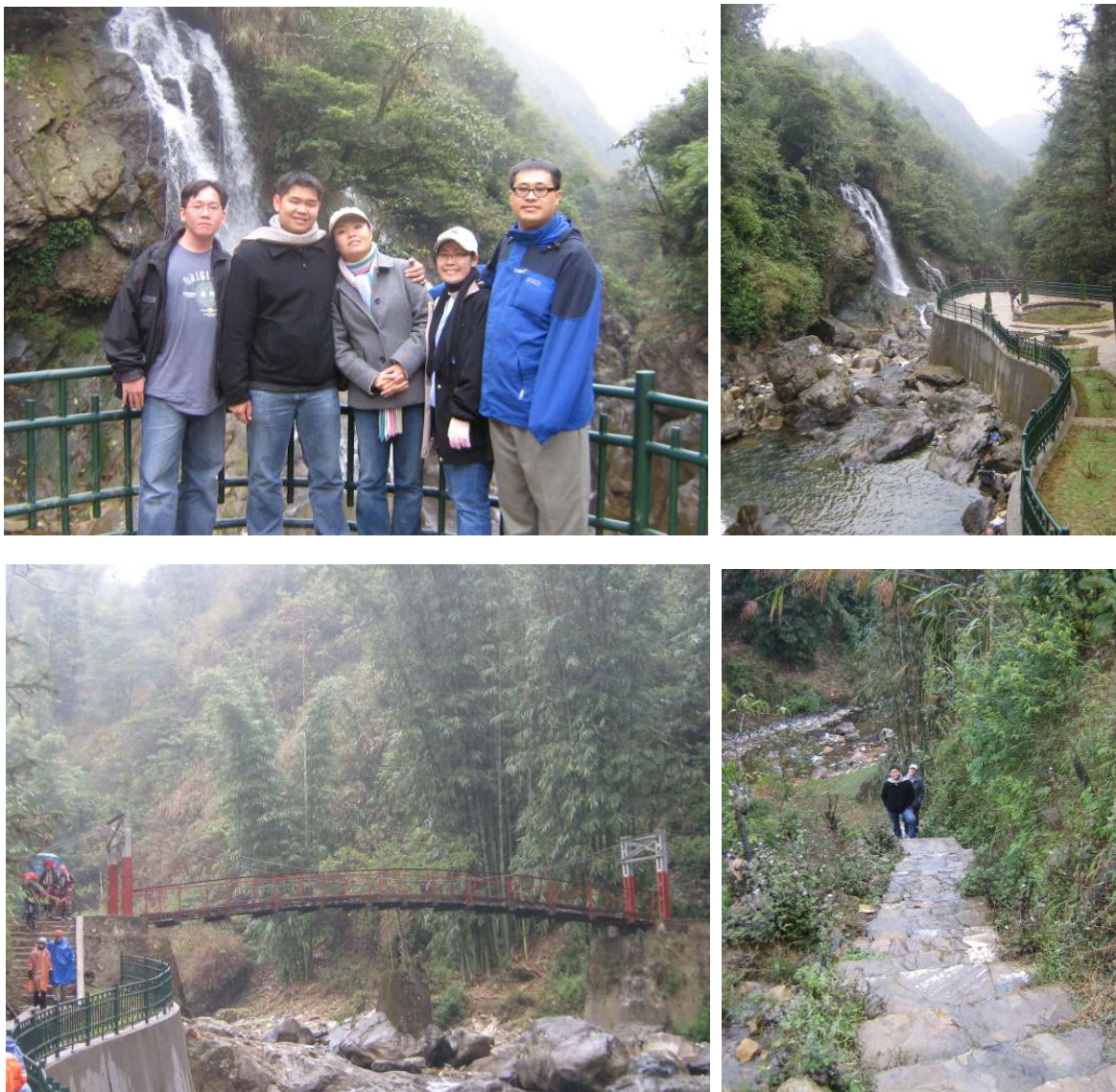
Figure 6: The waterfall at Cat Cat. To get there we had to hike on rocky paths and cross a red bridge