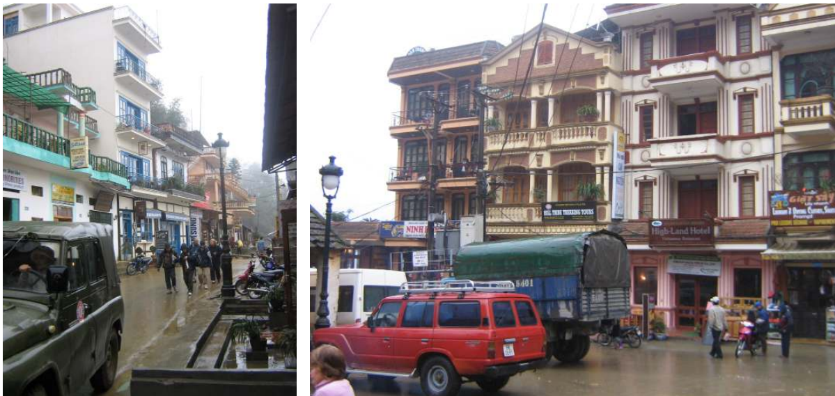
Figure 1: Driving into the town of Sapa

We finished breakfast at 10 AM and our tour guide explained our itinerary. We were supposed to visit a temple but had to cancel because the rainy weather made the hike there quite dangerous. Instead, our first stop was visiting a village of Ta Phin people. This village was a half-hour drive from Sapa by windy, mountainous roads. Our van pulled up in a paved parking lot at the front of the village. We got out and were immediately mobbed by a dozen of the local ladies, all of them trying to sell us hand-made trinkets like embroidery, hats, and clothing. The tour guide proceeded to lead us through the village, showing us different huts, the different crops grown here, and the development projects the government was sponsoring here. The entire area was lush with forests interspersed by rice paddies owned by the local farmers. The locals lived in huts made of straw, wood, mud, and occasionally, metal siding. Many also raised farm animals like pigs and chicken. The villagers followed us everywhere we went and tried talking to us. Many of them were more fluent in English than the citizens of Hanoi. This was because during the Vietnam War, many of the locals and their ancestors either did business with or were allies of US soldiers. The villagers following us were all women, some carrying their children. Many of the mothers were quite