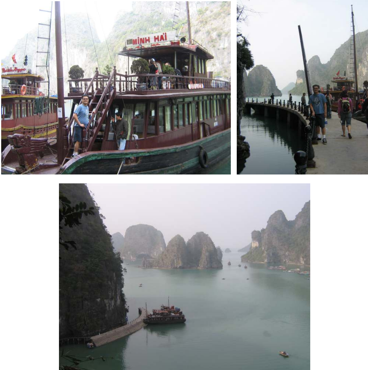
Figure 6: Our boat docked at the island of Thien Cung and Dau Go caves

option won out. So we sailed towards another island. By the time we got there, the tour guide said we only had 30 minutes to stay on this island. So we all rushed to climb to the top of the mountain. The path was paved, but the grade was quite steep and each of the 365 steps was small; not meant for large American feet. It was quite arduous to get to the top, but once at the top, we could sit and relax in an open-air temple that had a great view of the bay.