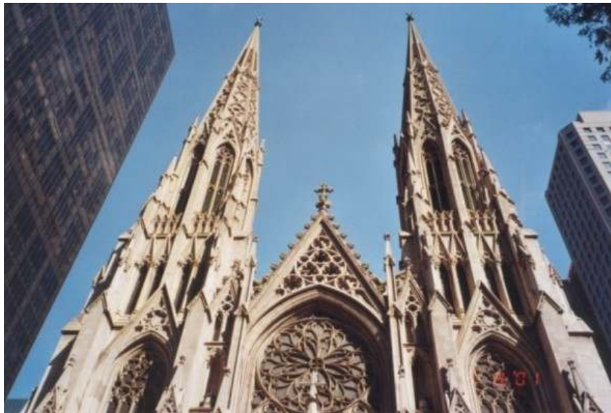
Figure 2: St. Patrick's Cathedral

During the night, we went to the Empire State Building. This is now the tallest building in NYC, and the base of it is filled with restaurants and shops. We had dinner at the Heartland Restaurant, which served American food. Afterwards, we went up to the 86th floor of the Empire State Building from which we could go out onto a large patio and see the whole city. Unfortunately, it was extremely crowded. There were probably 1000+ people standing shoulder to shoulder on this patio