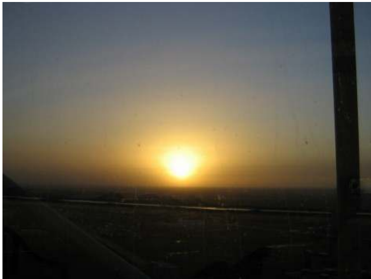
Figure 9: Lookout room. Outdoor walkway circling the tower