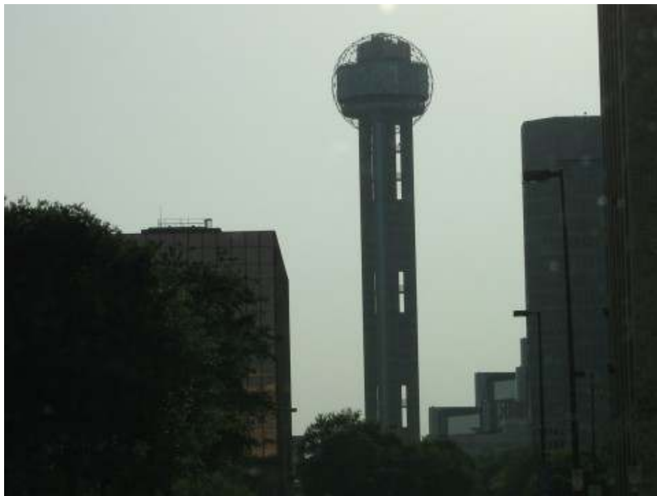
Figure 7: Reunion Tower at Hyatt Regency Dallas. Experience 3 levels : Antares Restaurant, The Dome Lounge and Observation Level / lookout room

The observation level / lookout room captures a 360 degree view of Dallas, and an outdoor walkway circling the tower. Both the Antares restaurant and the Dome gently rotate, making one complete revolution every 55 minutes.