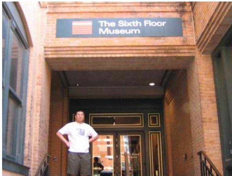
Figure 5: JFK was shot on this street