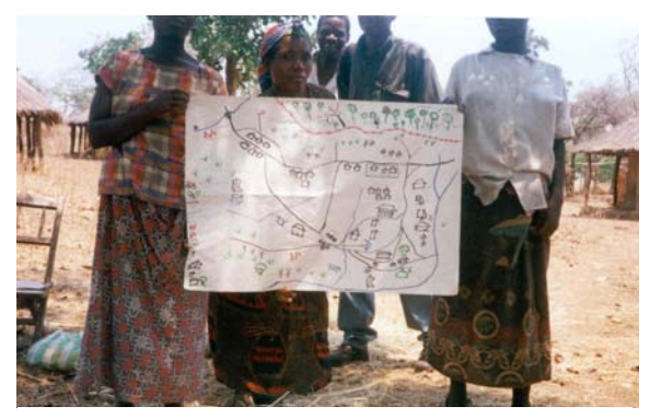
Sketch mapping is fun and creative, but real updated names and locations are needed; using a topo map template to fill in with informants works better.

A section of the topo map showing streams, old roads, principal hills, and old villages should be scanned and enlarged to 1:10,000 scale for the area where the sketch map is