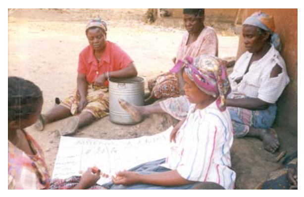
A classic tree-ranking exercise with women

The preliminary PRA study should be designed so that villagers name and rank the most important trees and plants for different forest products. Once the most important species are known, they can receive special attention during the inventory and even have their own table or column to be filled out on the field sheets with their own variables. Village occupation information will combined with preferred species information allows calculation of the minimum number of trees that are needed each year to sustain a given livelihood.