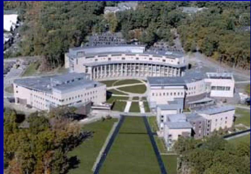
Table of Contents—Teaching