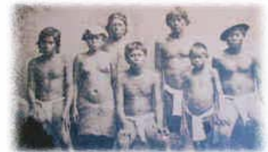
Costa Rica right ethnic groups are divided into twenty two regions