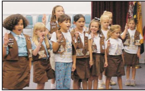
Brownie Scouts practice for the Ceremony