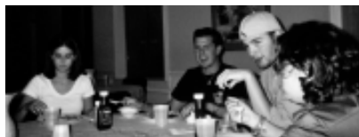
Students enjoy a meal during one of Hillel's Kosher Cafés.