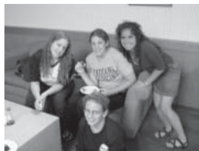
Students at JEWSHI - an event held by Hillel with sushi.