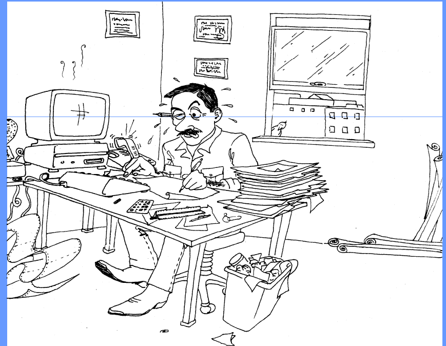
Table of Contents- Attorney