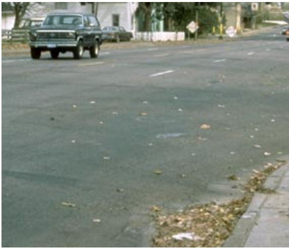
- Shoulder conditions.