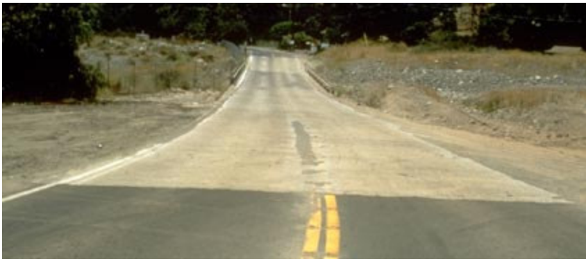
- Texture changes.