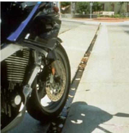
- Objects on the surface.