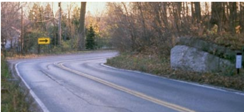
- Intersections and merge areas.