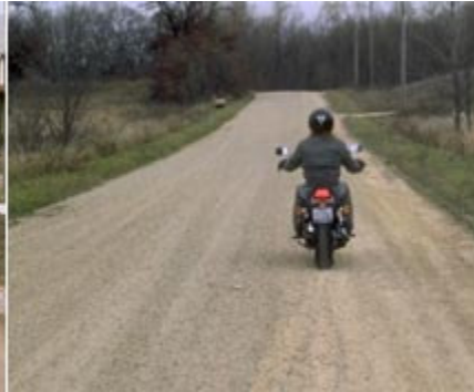
- Edges of roadway.