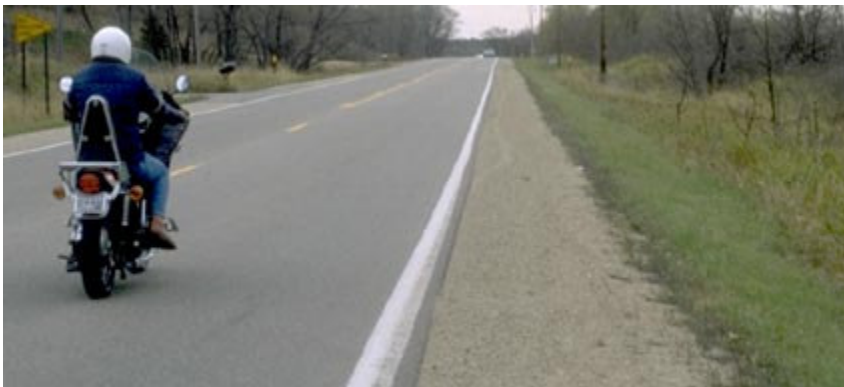
- Slope of the roadway.