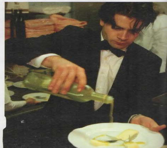
A careful pouring of olive oil ► turns a plate of sheep cheese into a work of art.