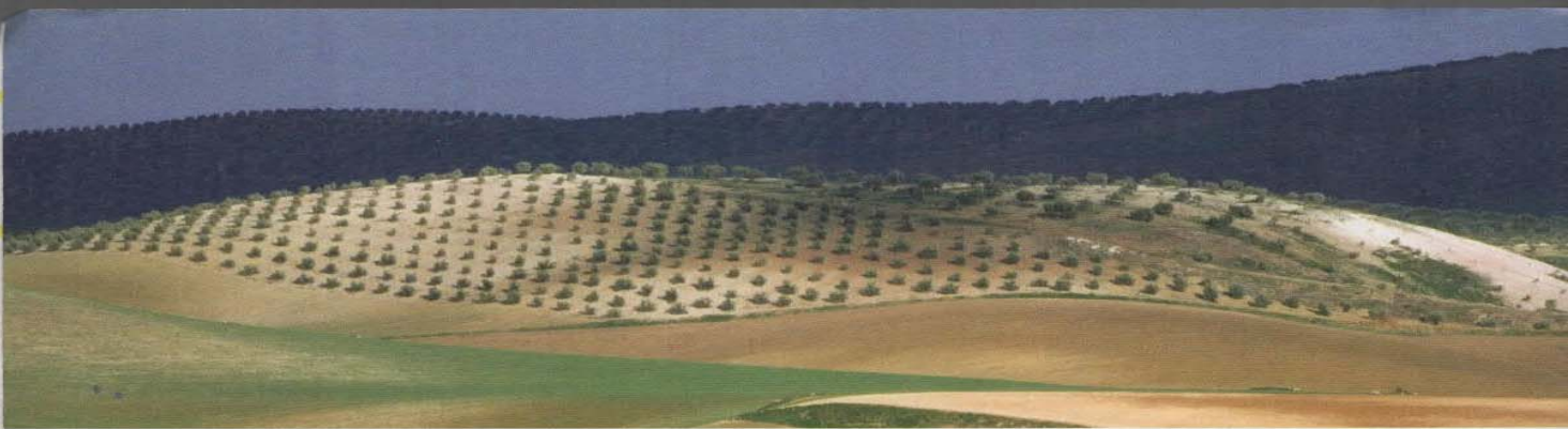
▲ Rows of young olive trees line the hills of Andalusia in Spain, the world's leading olive oil producer.