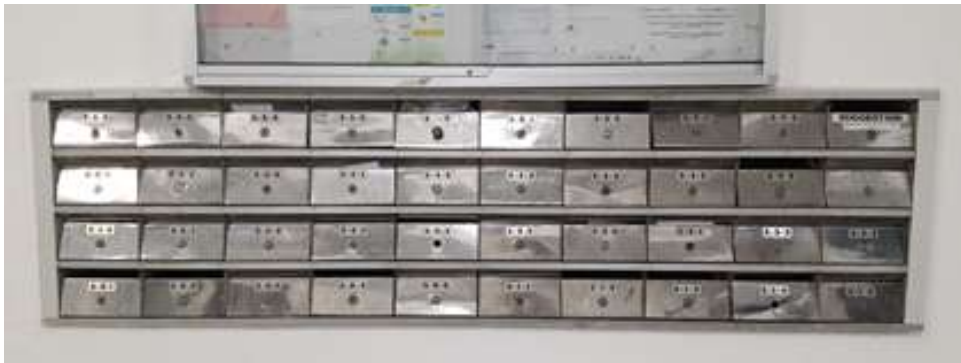
Figure 1 Condition of damaged and unmanageable letterboxes at flat

The main objective of the radio wave signal letterbox is to keep the letter and letterbox safe. Besides, residents will be alert by receiving a message or signal when a letter is dropped into the letterbox or the invasion occurs in the letterbox. Through this innovative letterbox, the problems faced by residents can be solve. However, there are also some limited requirement for this design. Among those includes the distance between the transmitter and receiver. It must be less than 25 meters and operated by electricity and battery so that the sensors can detect all objects that are inserted or dropped into the letterbox well, including letters and papers. The advantages of this system can be to facilitate the residents to receive information more quickly and accurately. They do not need to check the letterbox if the buzzer does not sound or the LED light does not turn on. This design does not require a large space for the installation of the circuit either in indoor unit or outdoor unit. In addition, this circuit system is user friendly and does not require high installation cost. The figure below illustrate the condition of the letterboxes that are unmanageable and are in unsafe condition.