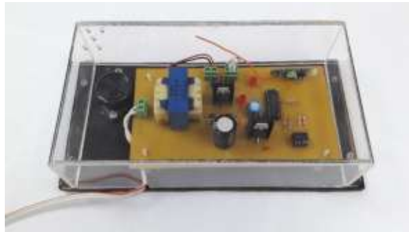
Figure 7 Position of electronic components in the indoor unit