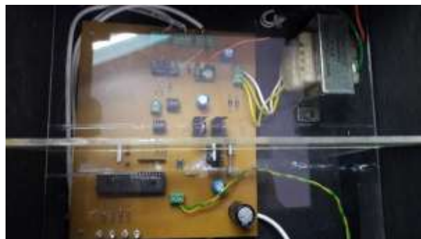
Figure 6 Position of electronic components in outdoor units