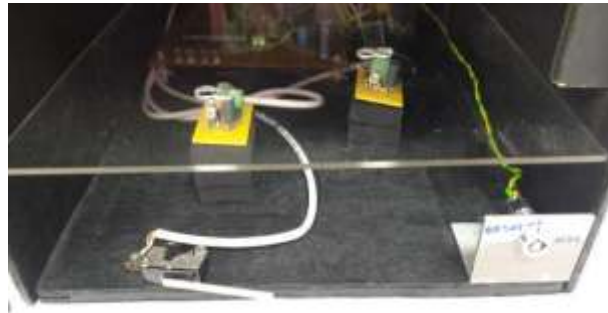
Figure 5 Position of reset components, limit switches and sensors