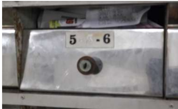
Figure 3 The Condition of a damaged lock at the letterbox