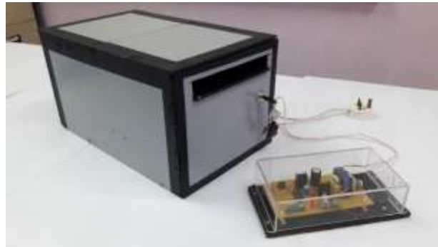
Figure 8 Radio wave signal letterbox