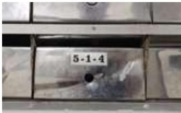
Figure 2 The Condition of losing the padlock of the letterbox