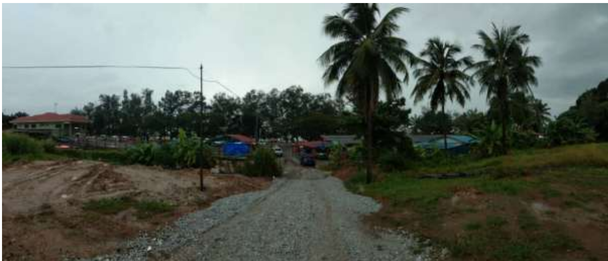
Figure 3 View from the purposed site

PD Central Market will be the main attraction for shopping gift and souvenir in Negeri Sembilan. It's functional for promote the local art and culture of Negeri Sembilan that rich in handicraft which highlights on the identity of local culture. It also provides daily fresh market for local people buy their daily needs. The Central Market also promote on local culture such as traditional dance and history of Negeri Sembilan. This art and culture promoting programme need to collaborate with Malaysia Department of Information. This project will increase the economy that brings business and jobs opportunities the locals. Employment opportunities in the field of management, tourism and business can reduce the number of migrant populations to work. The structure should provide the employment of a group of operators that, through specific courses of professional formation, would be formed to manage the business and tourism aspects. In addition, The PD Central Market, with all that it represents, encourages a series of related thematic activities which enhance the occupation and the economy well more than the simple employment of the staff.