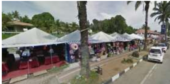
Picture 3 Shop lots that have at saujana are not proposing well.