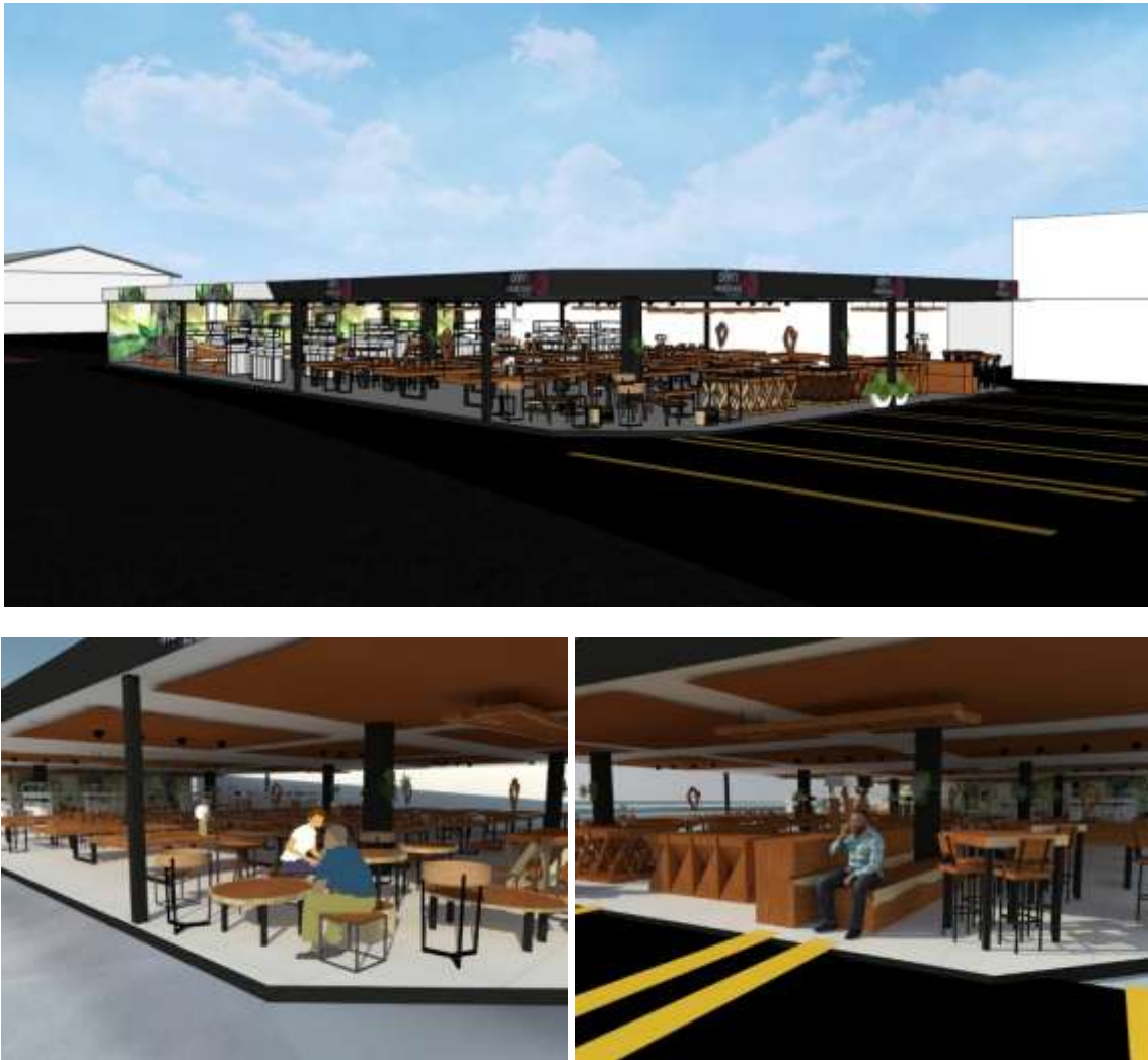
Figure 5 Proposed night market

The Central Market will be support by night market that provides shelter and proper business lot. The new night market design is more organise and easy to maintain. The facilities and structure will increase the comfort to the user that can give them more time for spending in the night market.