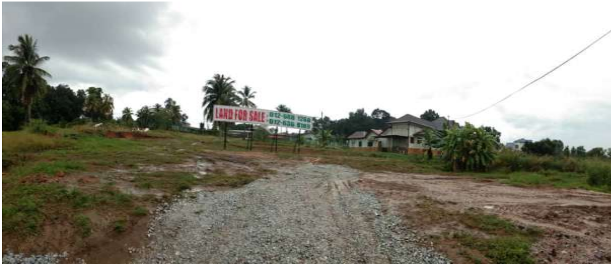
Figure 2 Recommended purposed site

Through this proposal our team has decided to propose the Central of market place for locals and tourist at Pantai Batu 4. Pantai Batu 4 received over 3000 tourists every weekend and the number will increase during public holiday. The recommended purpose site was near to the existing night market that operates every Saturday 2pm until 11pm.