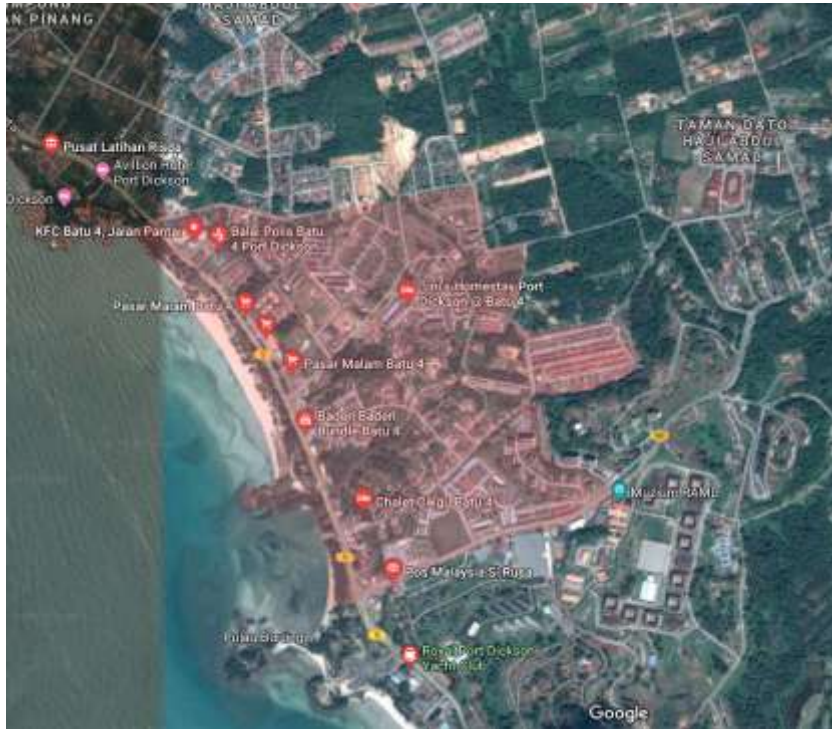
Figure 1 Pantai Batu 4 area is in highlighted mark