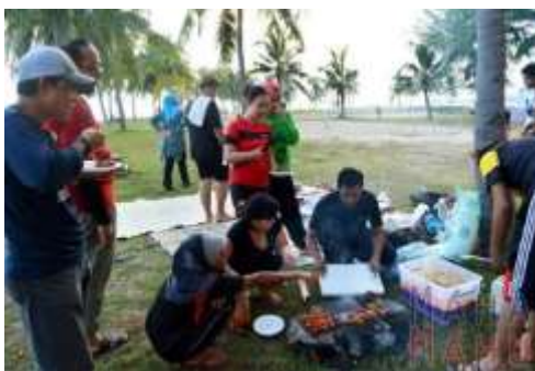
Picture 1 Public people who want make a barbeque at this place need to bring their own equipment.

Pantai Batu 4 is famous for its barbeque party, and it's never a better time to have one with your family. Find the perfect spot and set up your equipment. There also have some spaces for camp site for those whose like to stay at the beach to feel the sea breeze and make camp fire. Indulge at the food trucks. Pantai Saujana in PD has many food trucks offering a variety of food and drinks. Head on down to the parking lot and sample one of the many delights available. The main issues of Pantai Batu 4 are it always traffic jam within weekend. Its also lack of facilities such as public toilets for tourists after sea bath to cleanse themselves and showering. This place does not have any problem when it come for amenities because its have many kind of restaurants from local restaurants and also fast food such as KFC. Pantai Batu 4 also popular with one of the biggest night market in Port Dickson. This is a good chance for the residents to boost up their local products such as fresh seafood towards the public people and also tourists. Difficult accessed to public toilet make it difficult for the tourists to use its. There are also not enough public toilet and bath for tourists to take a shower. Shop lots that have at saujana are not proposing well. But the qualities of goods that have been sale are quite fresh and good for buyer.