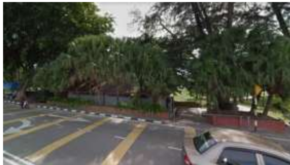
Picture 4 Hidden public toilet makes it difficult for tourists to access