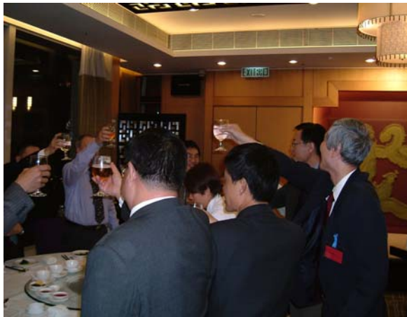
A happy banquet