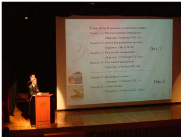
The opening session