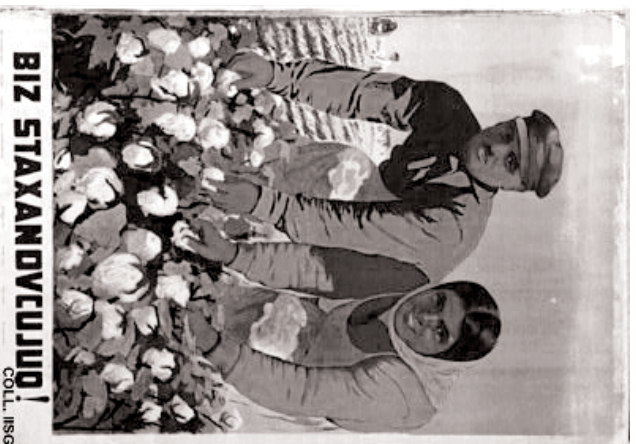
"We Work Like Stakhanov!"

Russia was to experience the charms of material incentives, elite workers, hard and forced labour camps, and "communist Sundays". But let's not turn history upside down. The Russian proles did not fail because of a misguided belief in the myth of liberation through work: it's their failure that gave a free rein to an unprecedented glorification of work. Who truly believed in a "communist Sunday", except those who could expect some symbolic or material reward out of it? Stakhanovism was to