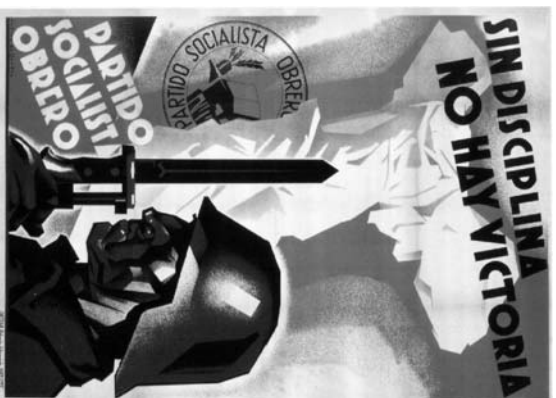
"Without Discipline There Is No Victory"

Loathing work had long been a permanent feature of Spanish working class life. It continued under the Popular Front. This resistance was in contradiction with the programme (particularly upheld by the anarcho-syndicalists) calling the prolies to get fully involved in the running of the workplace. The workers showed little interest in factory meetings which discussed the organising of production. Some collectivised companies had to change the meeting day from Sunday (when nobody cared to turn up) to Thursday. Workers also rejected piece rates, neglected working schedules, or deserted the place. When piecework was legally abolished, productivity fell. In February 1937, the CNT metalworkers' union regretted that too many workers took advantage of industrial injuries. In November, some railwaymen refused to come on Saturday afternoon.