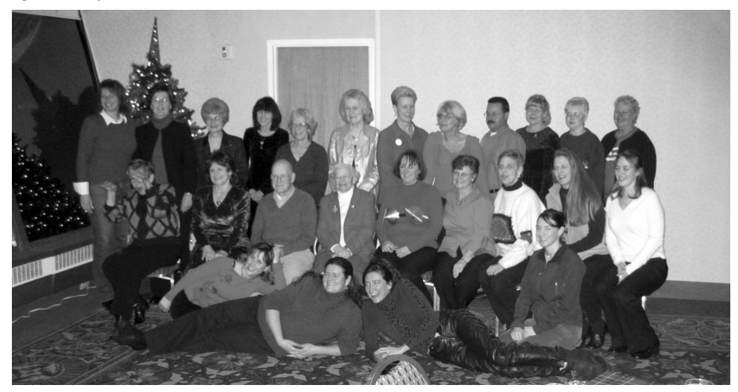
This photo was snapped at the December Alaska Chapter Christmas party held at the Hilton. Looking good girls!

Every man should be born again on the first day of January. Start with a fresh page. Take up one hole more in the buckle if necessary, or let down one, according to circumstances; but on the first of January let every man gird himself once more, with his face to the front, and take no interest in the things that were and are past.