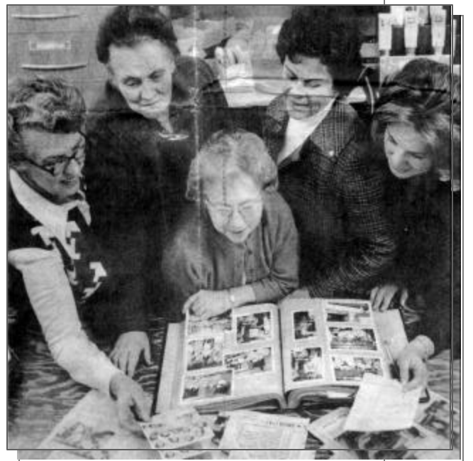
ANCHORAGE DAILY NEWS CLIPPING

Pat continued to fly when there was money to rent a plane at the Seven Star Flying Club at Merrill Field, and put fuel in it, which wasn't too often.