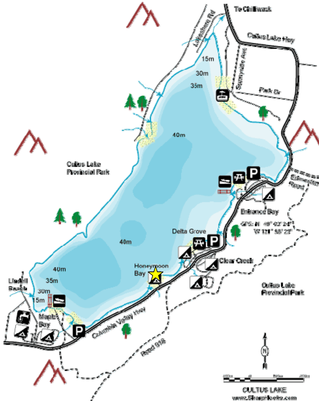
★ Honeymoon Bay campsite

** Please note that Honeymoon campsite “A” is used by another group.