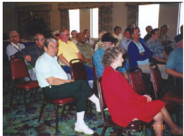
2nd group meeting - Navy LI rating update

Editor's note: As of the printing of this newsletter a commonality study was recently conducted on the LI rating and it was recommended that the Lithographer's merge with the Photographer's Mates (PHs). The recommendation will be processed up the chain of command for approval or disapproval. No time frame is known concerning conversion if this is approved.