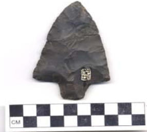
Typical Snook Kill Projectile point