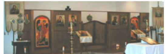
Iconostatis as it is now, without feast days and Last Supper.

Keep praying on it and the way will become clear.