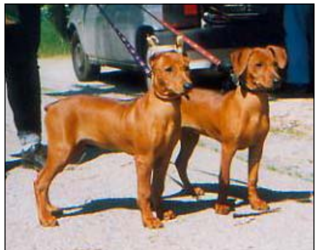
Isis with sister Izba