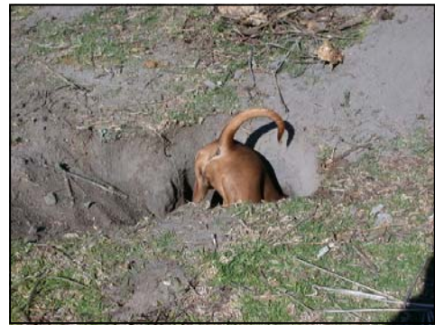
Here I come rabbits.....